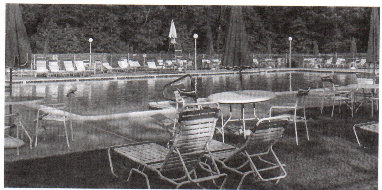
The state guidance for summer recreation requires community pools to follow both state and CDC guidance, which includes operating at reduced capacity and encouraging social distancing.